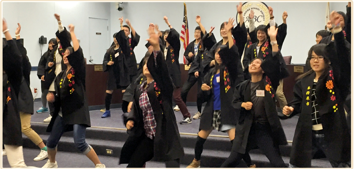
The Japanese middle school students perform a popular dance for the host families in ABC and District guests.