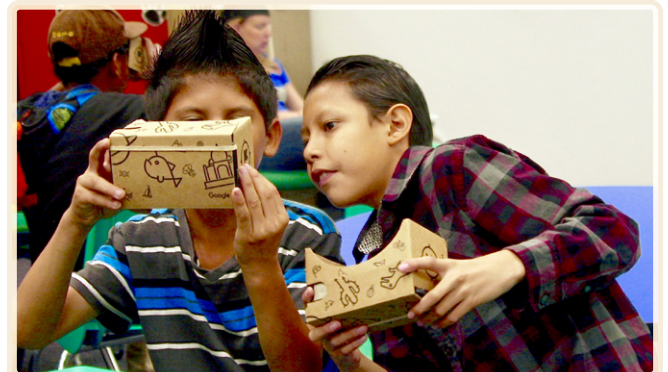
Google' Expeditions Pioneer Program

Expeditions teams visited selected schools around the world, starting with the United States, Australia, New Zealand, the United Kingdom, and Brazil. Juarez Academy was one of five locations in the US that were given the chance to participate and provide feedback on this new and exciting product. Students and teachers alike were awe-struck! They described the experience as "amazing" and "innovative." After the Expedition, students submitted a reflection about the experience to their teachers and administrator through Google Classroom. As one student stated, "[This] is really good for learning... you can go almost anywhere in the world!" See more about the Juarez Expeditions experience on YouTube! ▶