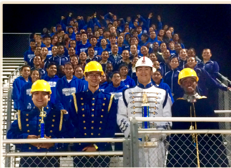
Gahr HS Marching Gladiators

The Gahr High School Marching Gladiators competed at the Newport Beach Open Field Tournament and won 1 st place in the top 5A division! ▶